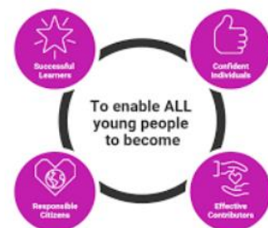
The Four Capacities

Curriculum for Excellence serves all 3-18 year olds across Scotland: wherever they learn. It aims to raise standards, prepare our children for a future they do not yet know and equip them for jobs of tomorrow in a fast changing world.